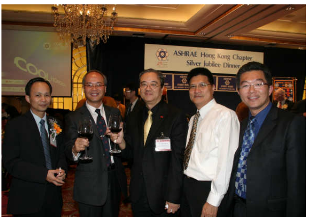
Group photo of the president of Hong Kong Chapter and our guests