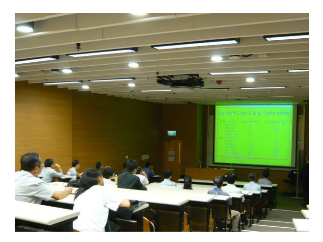
Audience played attention in the seminar