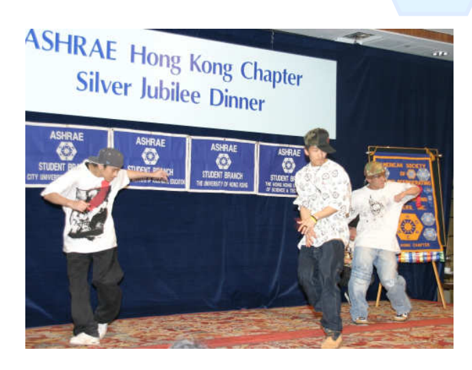
Performing pop dance