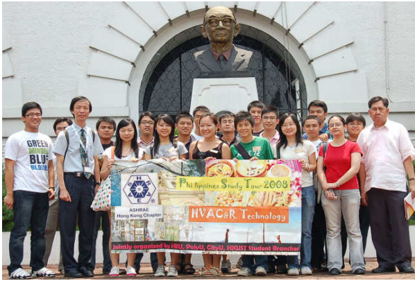
Group Photo of students

After planned for six months, ten students including me had gone for a seven-day Philippines Study Tour on HVAC&R Technology, which was jointly organized by the University of Hong Kong, the City University of Hong Kong, the Hong Kong Polytechnic University and the Hong Kong University of Science and Technology, from 25 th August to 31 st August 2008 in this summer.