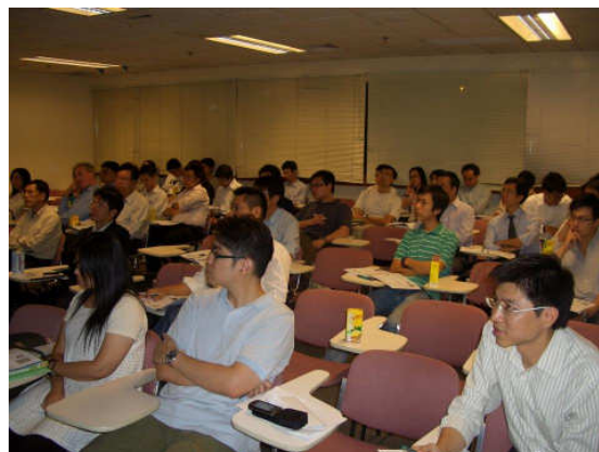
All audiences played attention during the whole workshop