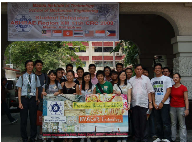
Group Photo of students!!

This study tour was successful. We finally had to thank for ASHRAE Hong Kong Chapters to support this enjoyable trip in this summer. Hope there will be more students to have chances to participate in and benefit from the activities jointly organized by ASHRAE and Hong Kong universities in the future.