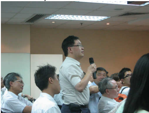
Participant actively discussed and shared their experience during the talk