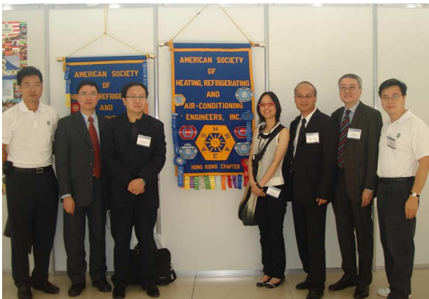
Group Photo during the Manila CRC!!

14 HK delegates and 10 HK students attended the Manila CRC. Sincere thanks are expressed to the host, ASHRAE Philippines Chapter, for the great hospitality (esp. food and alcoholics) and kind supports.