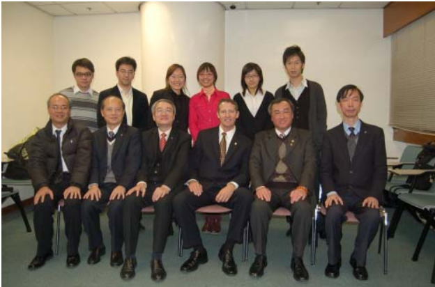
Meet with Young Members & Student Members