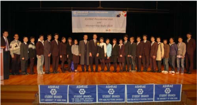
ASHRAE Presidential Speech & ASHRAE Night 2008 (Photo taken with members of our Student Branches)