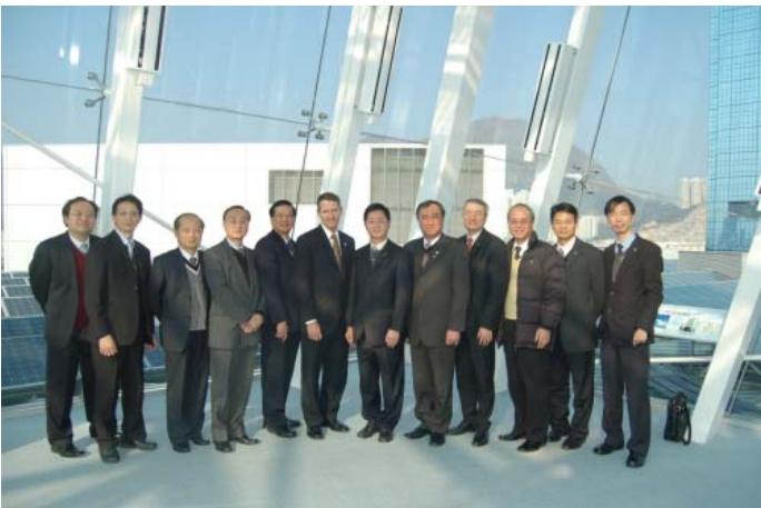
Visit to Electrical & Mechanical Services Dept. (EMSD)