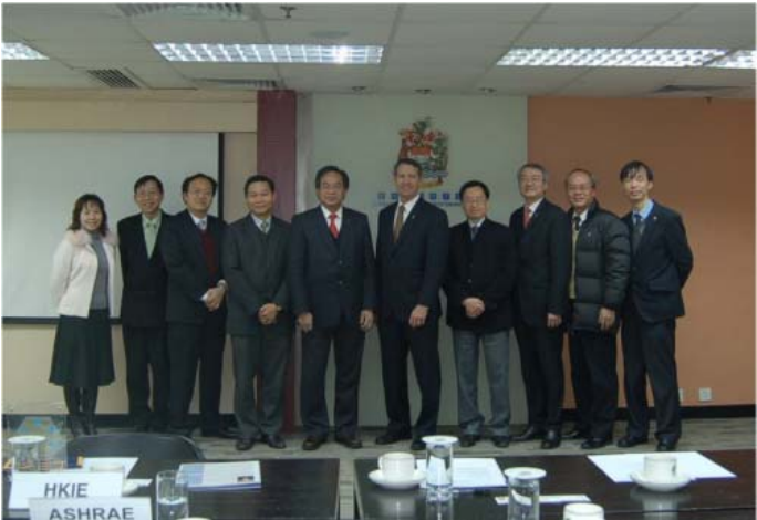
Visit to Hong Kong Institution of Engineers (HKIE)