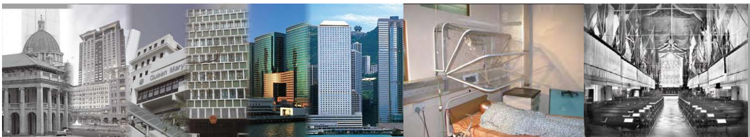
...25 building projects from 1912